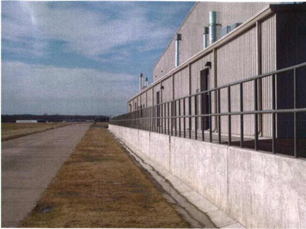
Southeast Side of Paint Hangar 3