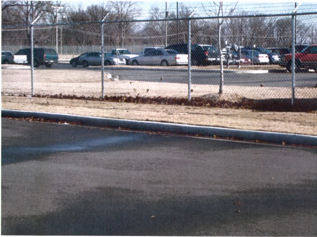
Northeast side of warehouse expansion