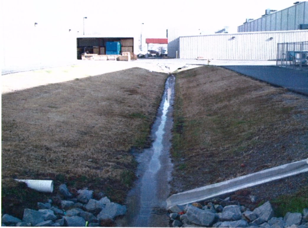
Southeast side of Warehouse Expansion.