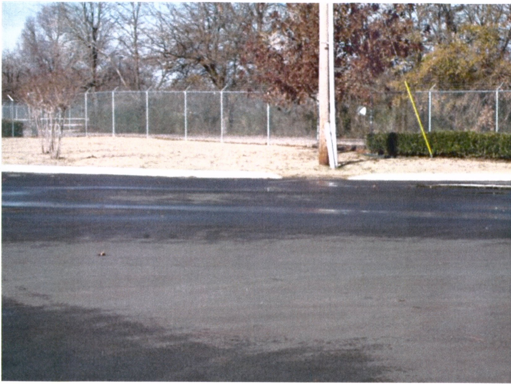
North END OF WAREHOUSE Expansion