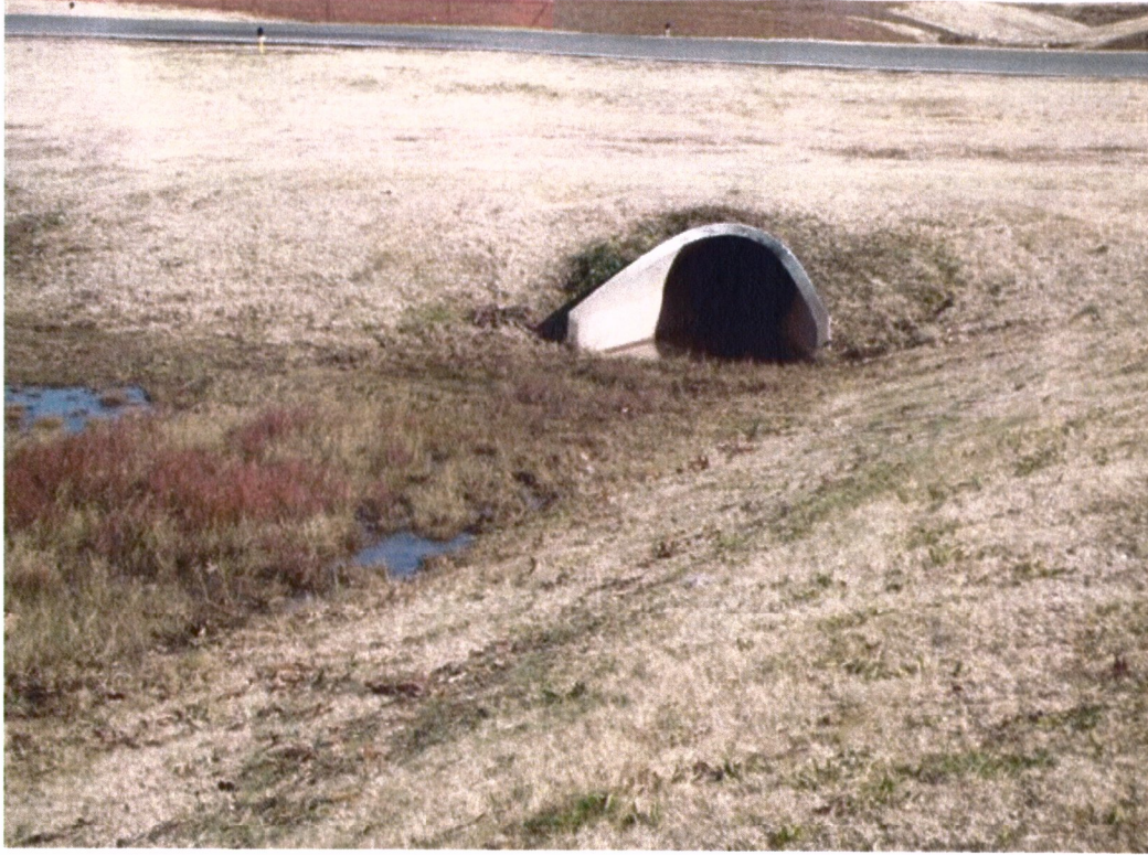
EAST SIDE OF PAINT HANGAR 3