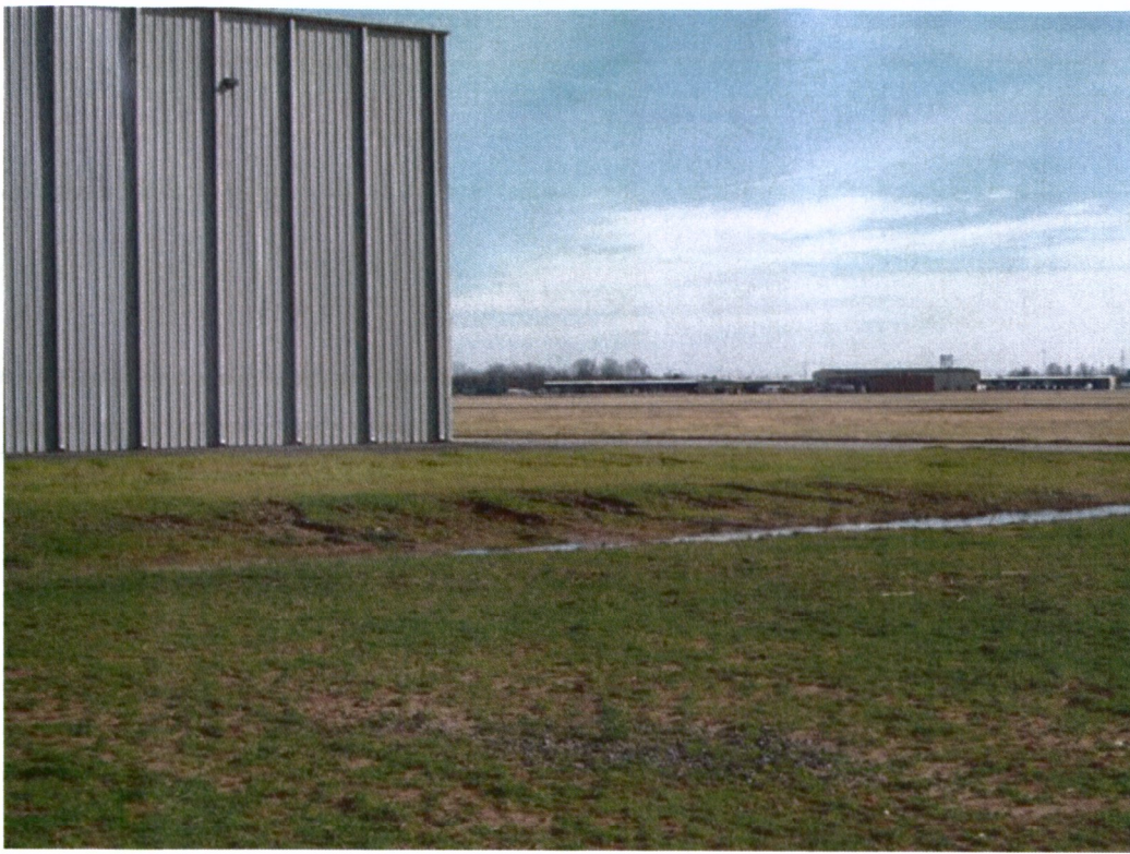
WEST SIDE OF PAINT HANGAR 3